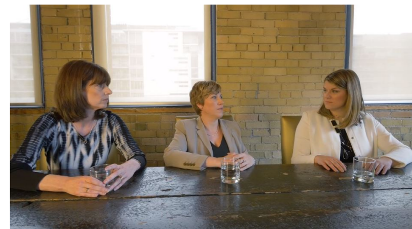
HRM TV invited three industry leading HR directors to a roun ...